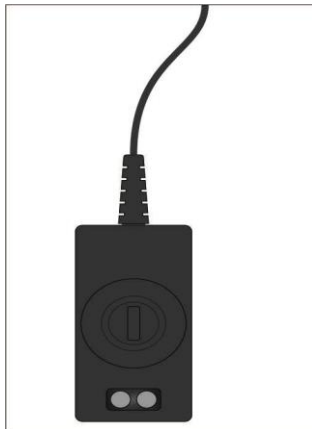
New style sensor

There has been a change to the Crewsaver CSL Lifejacket Light fitted to the RNLI Lifejackets. The difference is in the type of sensor fitted to the light, as shown below.