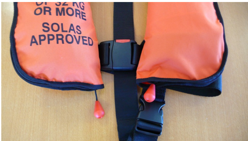
Woven nylon cord with toggle.