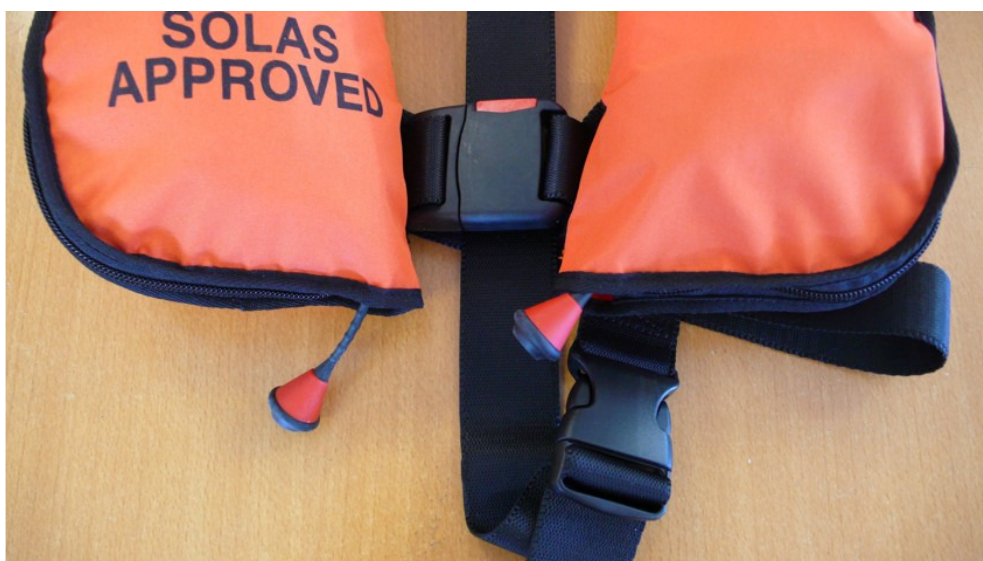
Moulded plastic cord and toggle.